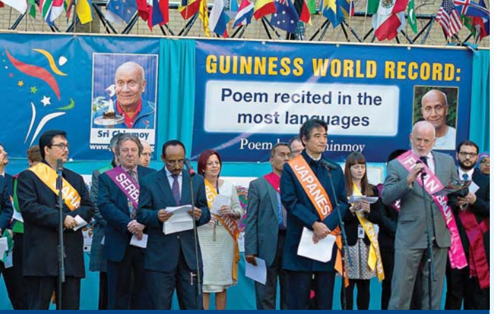
United Nations Diplomats join together to break a Guinness World Record reciting a poem of Sri Chinmoy's in the most languages at the global launch of the Peace Run in New York.