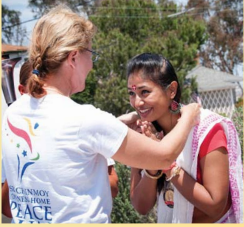
The Torch-Bearer Award program recognizes individual efforts by honoring peace-building pioneers from all age groups.