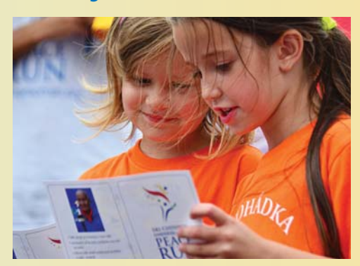
The Peace Run theme song has been performed in many countries and languages, providing joyful ways to express harmony and to share unique talents.