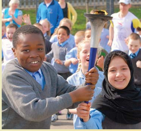
Appreciating the unity in diversity strengthens us. Far more unites than divides us. Above is a group of students in USA.