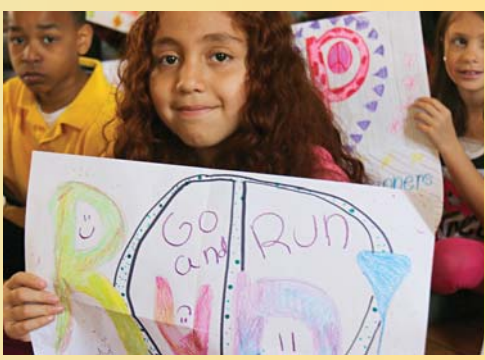
Peace themed art exhibits and poetry events are wonderful occasions to bring people together to express universal aspirations.