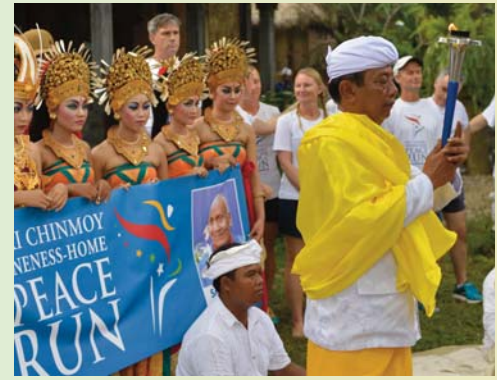
The Peace Run has been welcomed in churches, mosques, synagogues, temples and other places of worship. Through the Peace Run, a culture of peace and a feeling of universal oneness is being fostered.