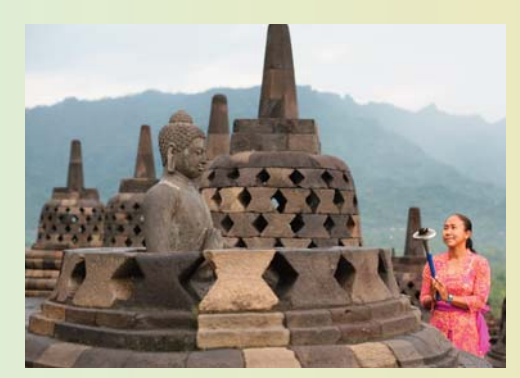
The Run visits renowned heritage and cultural sites, many recognized by UNESCO, to encourage people to experience the values and culture of others.