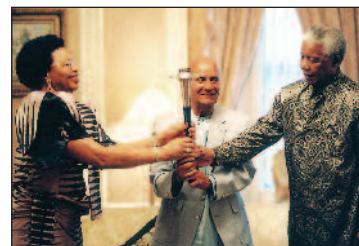
Nelson Mandela, former President of South Africa, and his wife Mama Graça Machel with Sri Chinmoy.