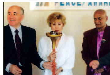
Former Soviet President Mikhail Gorbachev holds the torch with Raissa Maximovna as Sri Chinmoy looks on.