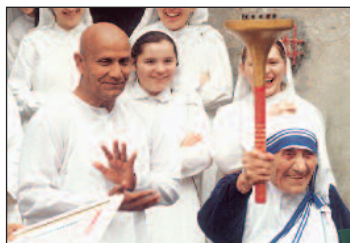
Mother Teresa and Sri Chinmoy celebrate the spirit of harmony.