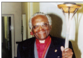
Archbishop Desmond Tutu shows his support for the Peace Run by holding the torch in South Africa.