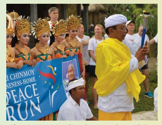
The Peace Run has been welcomed in churches, mosques, synagogues, temples and other places of worship. Through the Peace Run, a culture of peace and a feeling of universal oneness is being fostered.