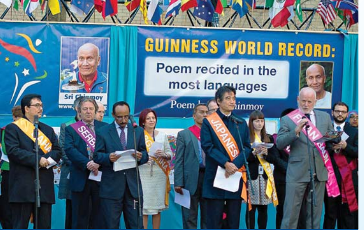
United Nations Diplomats join together to break a Guinness World Record reciting a poem of Sri Chinmoy's in the most languages at the global launch of the Peace Run in New York.