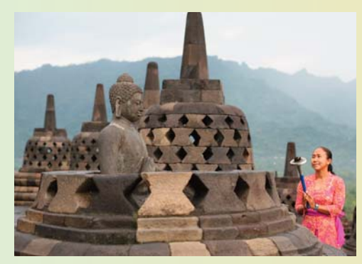
The Run visits renowned heritage and cultural sites, many recognized by UNESCO, to encourage people to experience the values and culture of others.