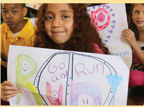
Peace themed art exhibits and poetry events are wonderful occasions to bring people together to express universal aspirations.