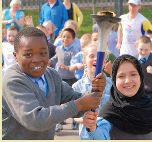
Appreciating the unity in diversity strengthens us. Far more unites than divides us. Above is a group of students in USA.