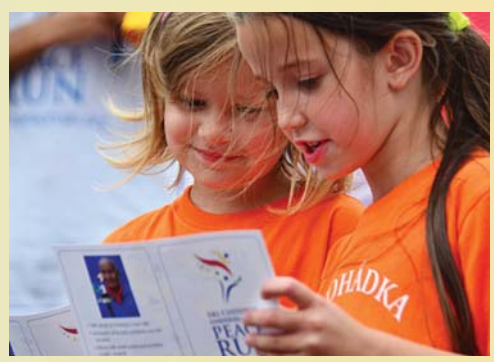
The Peace Run theme song has been performed in many countries and languages, providing joyful ways to express harmony and to share unique talents.